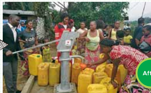
Image of handover ceremony. As soon as we conducted the ceremonial tape cutting, locals rushed to fill their bottles with water. They expressed great joy over being able to drink safe water.