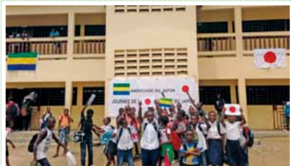
“The Project for Expanding Charbonnages Elementary School”, Gabonese Republic, FY2013