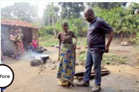
Image of the area before we provided support for constructing a water well. Locals were using unsanitary river water and were walking several kilometers to get water at the closest well.