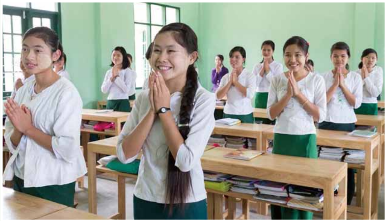
“The Project for Construction of Kun Long Basic Education High School in Kun Long Township”, Shan State Republic of the Union of Myanmar, FY2013