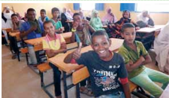
“The Project for Improving Elementary School No. 1 in Chagar CityIslamic”, Republic of Mauritania, FY2015

“Kusa” means “grass” and “Ne” means “roots” in Japanese.